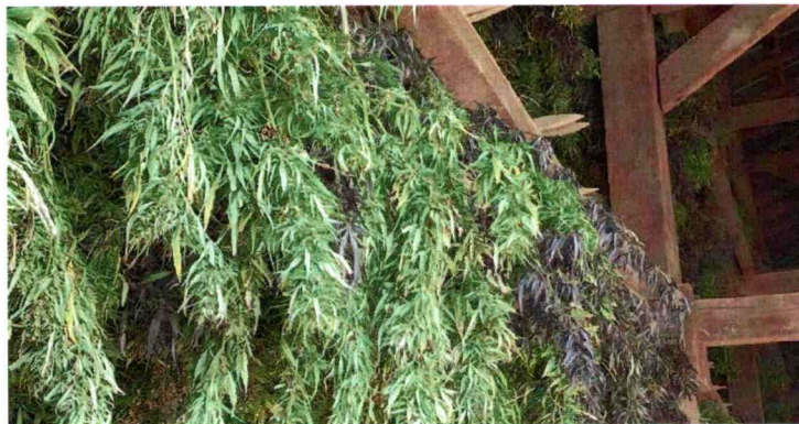
Farm to Pharmacy:

Ananda Health's 100% Kentucky grown hemp is planted, harvested, and dried using existing Kentucky tobacco infrastructure and knowledge. Kentucky farmers are now making the switch to farming Hemp with the passing of the 2018 Farm Bill and Ananda Health is right beside them providing superior genetics and support.