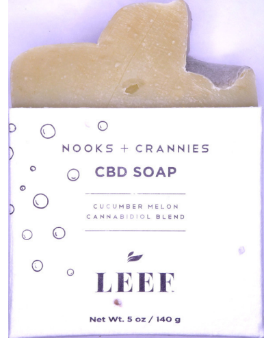
Sample Photo: rannies Cucumber Melon CBD Bar Soap

Results valid for sample tested. LOD / LOQ: 1 CFU/g. Sampling per 16 CCR 42 Article 3, if required. Report shall not be reproduced except in full, without written approval from Coastal Analytical.