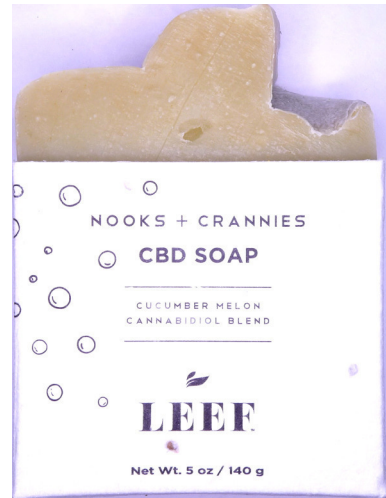
Sample Photo: rannies Cucumber Melon CBD Bar Soap

Results valid for sample tested and metrologically traceable to an SI unit. LOD = 0.0433 ug/mL, LOQ = 0.2164 ug/mL or better. Chemistry values are presented by weight per cent within an error of 4.5% of the reported value with 95% confidence. Sampling per CA BPC 26104(d), if required. Report shall not be reproduced except in full, without written approval from Coastal Analytical.